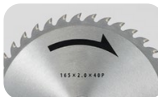
Edged tools (black-annealed marking)