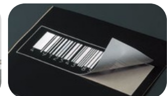
Partial cutting of labels