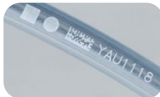
Medical tubing (silicone)