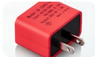
Switch covers (PP)