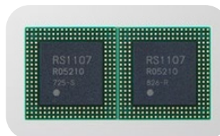
Molded packages (BGA)