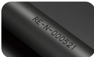
Vehicle body frames (deep engraving)